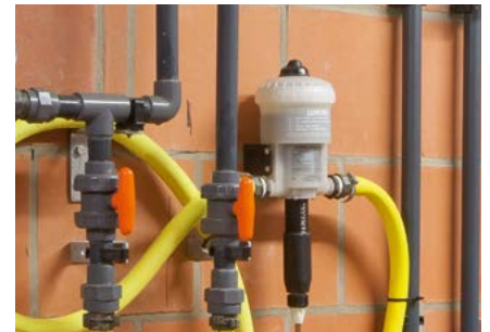
Medicator type 3 (acid-resistant)